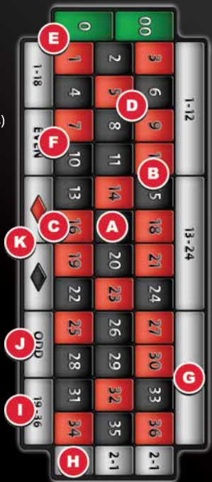
the diagram indicates various bets and their odds